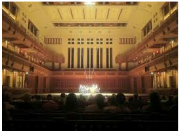
Ozawa Hall, Tanglewood